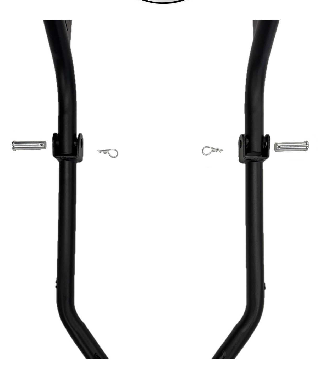
STEP 5 PUT THE PINS THROUGH THE TWO BAR ASSEMBLYS TO LOCK THEM TOGETHER. (ENSURE THE LOCKING CLIPS ARE ON THE INSIDE OF THE STAND)