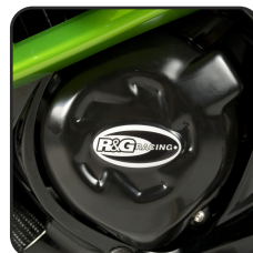
ENGINE CASE COVERS