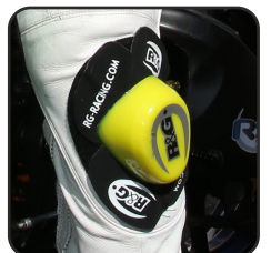
AERO KNEE SLIDERS