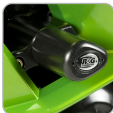
AERO CRASH PROTECTORS