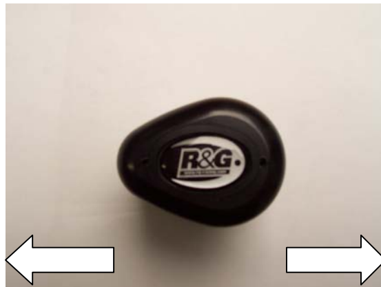
REAR OF BIKE